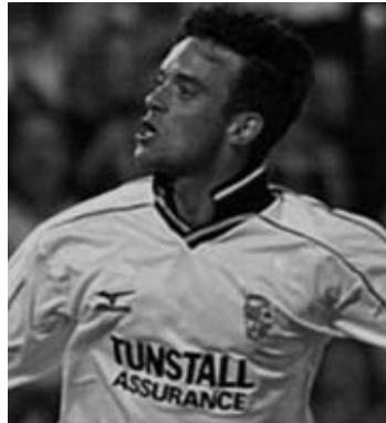
Amongst good company – fellow Vale shareholder Robbie Williams

shortage of money. "We'd like to know of anyone like that so we can help."