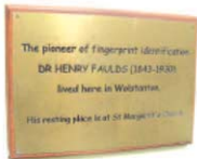
Commemorative plaque at Castle Comfort's Head Office. Henry Faulds resting place is at nearby St. Margaret's Church